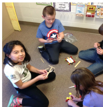
3rd graders working on forces and motion with the creation of the "Twirly Bird."