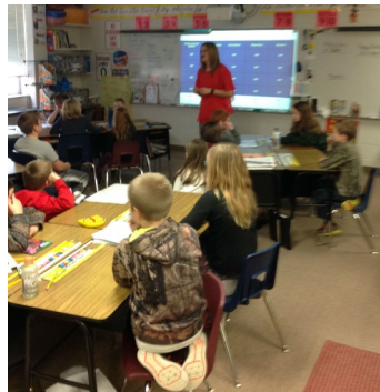
More science and forces.